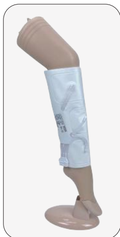
DISPOSABLE CALF SLEEVE 单人使用，小腿型