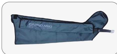
REUSABLE LEG SLEEVE 重复使用，全腿+足型