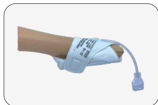
DISPOSABLE FOOT SLEEVE 单人使用，足型