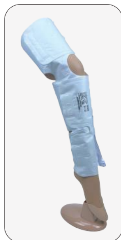
DISPOSABLE THIGH SLEEVE 单人使用，全腿型