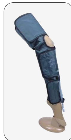
REUSABLE THIGH SLEEVE 重复使用，全腿型