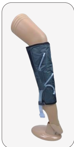
REUSABLE CALF SLEEVE 重复使用，小腿型